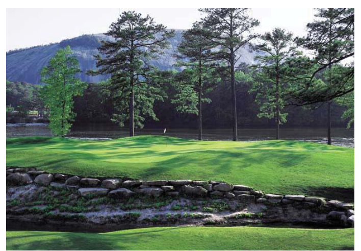
Stone Mountain Golf Course

Premiere Sponsor: $1,000 Set up a tent on a tee box and promote your company! Create a game that golfers can play while visiting your tee box or hand out company information and "freebies"! Hole options will be selected on first come, first serve basis. Includes Green Fees for four golfers, range balls, 8 mulligans (2 per golfer), tee box sign, two box lunches and dinner buffet after golf. Premiere sponsors will be recognized on the large "Welcome Banner" upon entrance to the club as well as on a special page in the newsletter immediately following the event and any pre-event marketing. *Alcoholic beverages are NOT permitted. All other beverages are encouraged.*